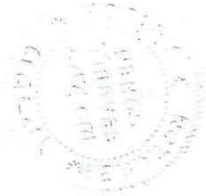
חותם הנוטריון Notary's Seal